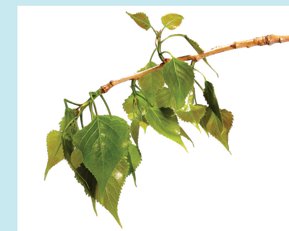
Black Poplar ( Populus nigra subsp. betulifolia )

Britain's smallest rodent lives here too, making a home in tightly woven nest balls hidden in tussocks of grass. Fruit, grass seeds and small invertebrates make up a large part of their diet.