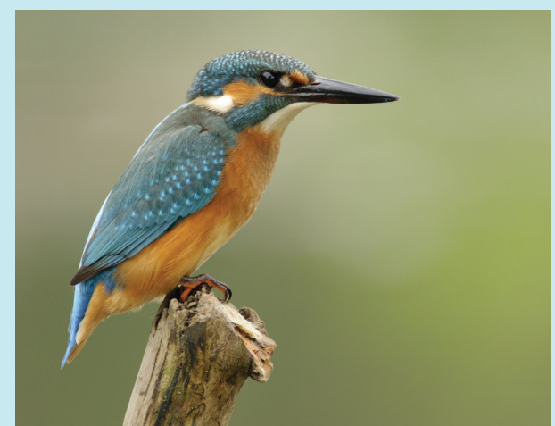
Kingfisher ( Alcedo atthis )

Usually found lurking on the river bed, this fish is an ambush predator, snatching small invertebrate prey such as shrimp and insect larvae with its large mouth. After females spawn, it is the males who guard the eggs.