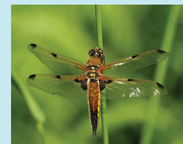
Four-spotted Chaser Dragonfly ( Libellula quadrimaculata )

Named after the incredibly long antennae of the males, this wonderful solitary bee has declined nationally, so we are fortunate to have such a rare insect living on our site. They love to feed on the nectar rich flowers of the trefoils and vetches.