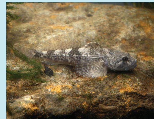
Bullhead ( Cottus gobio )

Depicted below are just a few of the species inhabiting this diverse area.